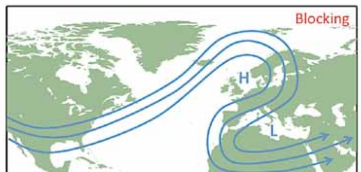
Some examples of jet stream winds during weather regimes, with high and low pressure systems marked.